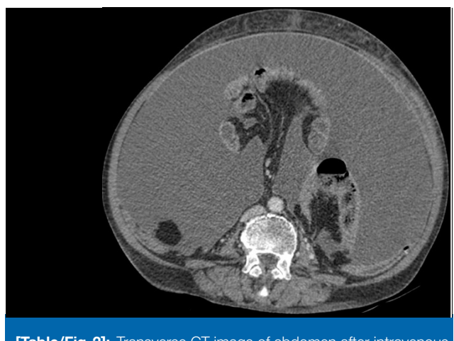
[Table/Fig-2]: Transverse CT image of abdomen after intravenous administration of 100 ml of the iohexol revealed intestinal small bowel loops displaced in the center of the abdomen & encapsulated in thick enhancing fibrous capsule with ascitis

fibrous capsule (open white arrow) with ascitis